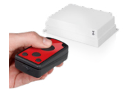
Configuration of a LED driver with ID ECCO Smart