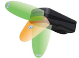
Identification in different orientations