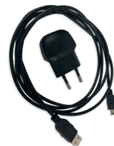
Power adapter 110 V / 220 V